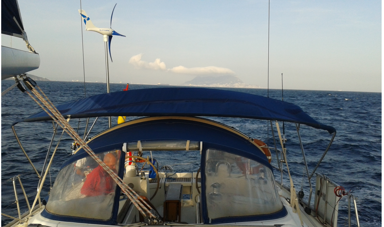
Out from Gibraltar.....

Established 2002 - Registered Yacht & Ship Agent - Broker for Sale and Purchase – Full Yacht Services – Worldwide Transport